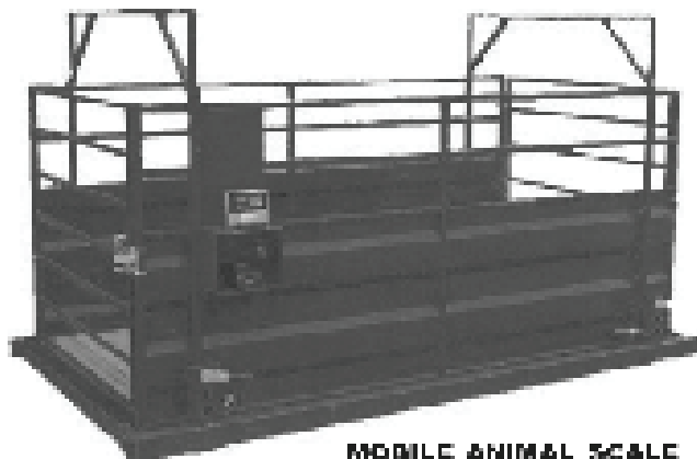
MOBILE ANIMAL SCALE w/WHEELS OR PORTABLE w/o WHEELS

Take the Scale to your Cattle.... Animal Weighing at any Location"